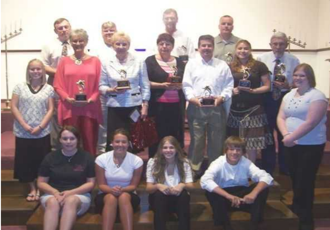
2009 Golden Deeds Honorees with OCCF Youth Council members