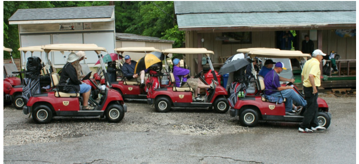
Thank you to all the businesses and individuals who participated or donated to the Women's Giving Circle's Golf Scramble. You make a difference!